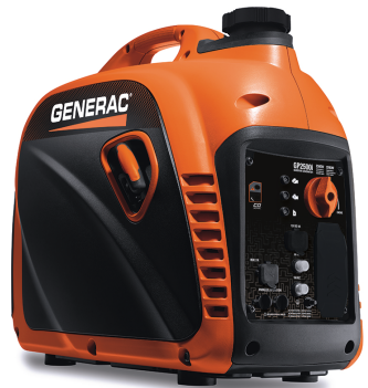
Photograph may not represent actual content.

Model G0082510 UPC:696471086256 (50 State/CSA) Model G0082511 UPC:696471099942 (50 State) Model G0082512 UPC:696471103946 (49 State/CSA)