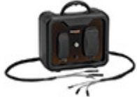
Model 7118-0 UPC:696471072853

AC Rated Output Running Watts 2200 AC Maximum Output Starting Watts 2500